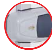
Key lock & internal safety release