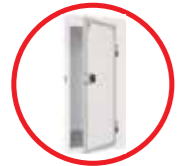
Right-hand swing hinge door