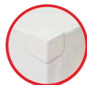
Rounded corner cap

A External rounded edge B Polyurethane foam C Internal covered corner