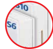
Polyurethane panel (PUR) Cool rooms: 60mm Freezer rooms 100mm