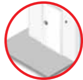
250kg roll-in flooring