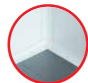
Internal covered corners & external rounded corners