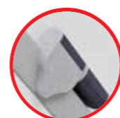
Durable & adjustable door hinges